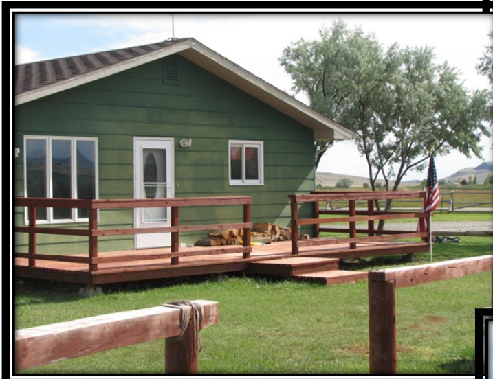
Deck off Kitchen & Family Room