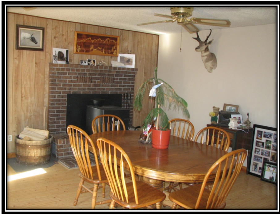
Dining Room / Family Room