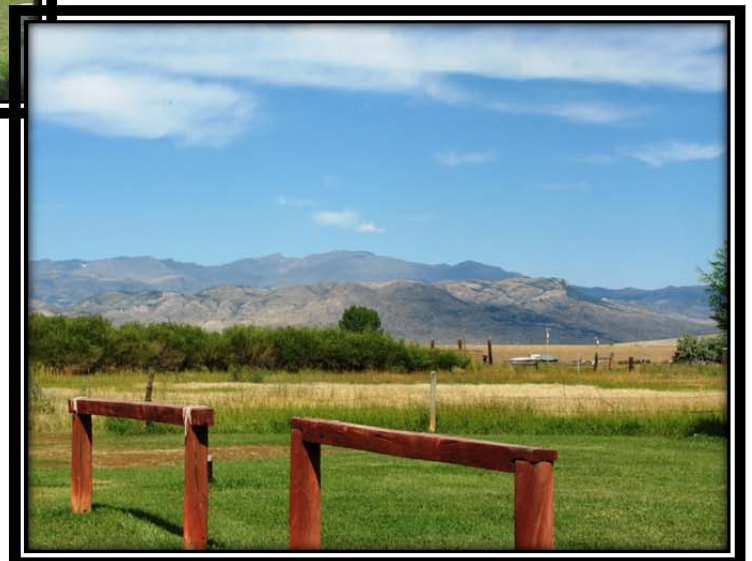
Yard with Views